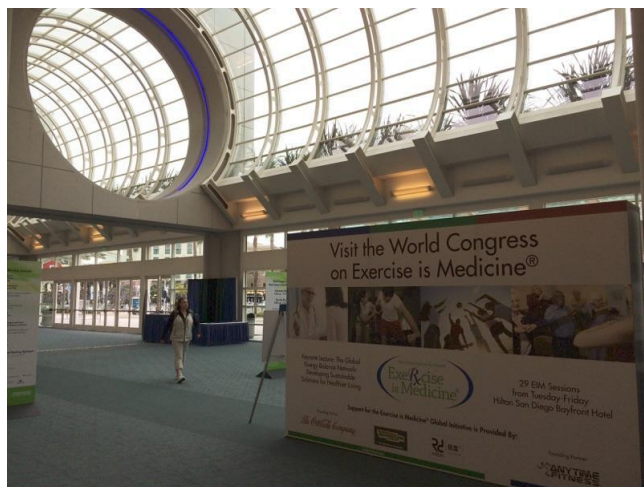
Inside the San Diego Convention Center