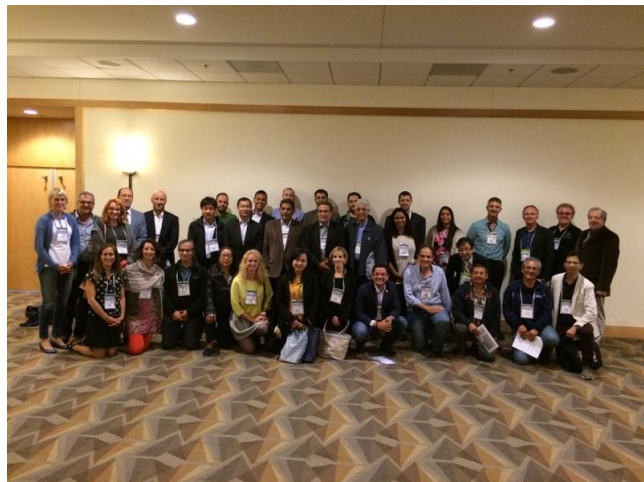
Group Photo of EIM National Center Directors from around the world

The meeting was a success in its attendance and sessions and we are looking forward to what is in store for EIM over the next year. We hope to see everyone again in Boston!